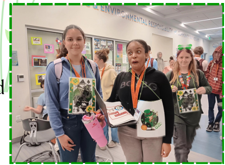
Girls who didn't lose thier lanyards